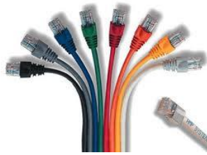
Patch Cord Cat5e