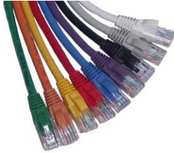
Patch Cord Cat6